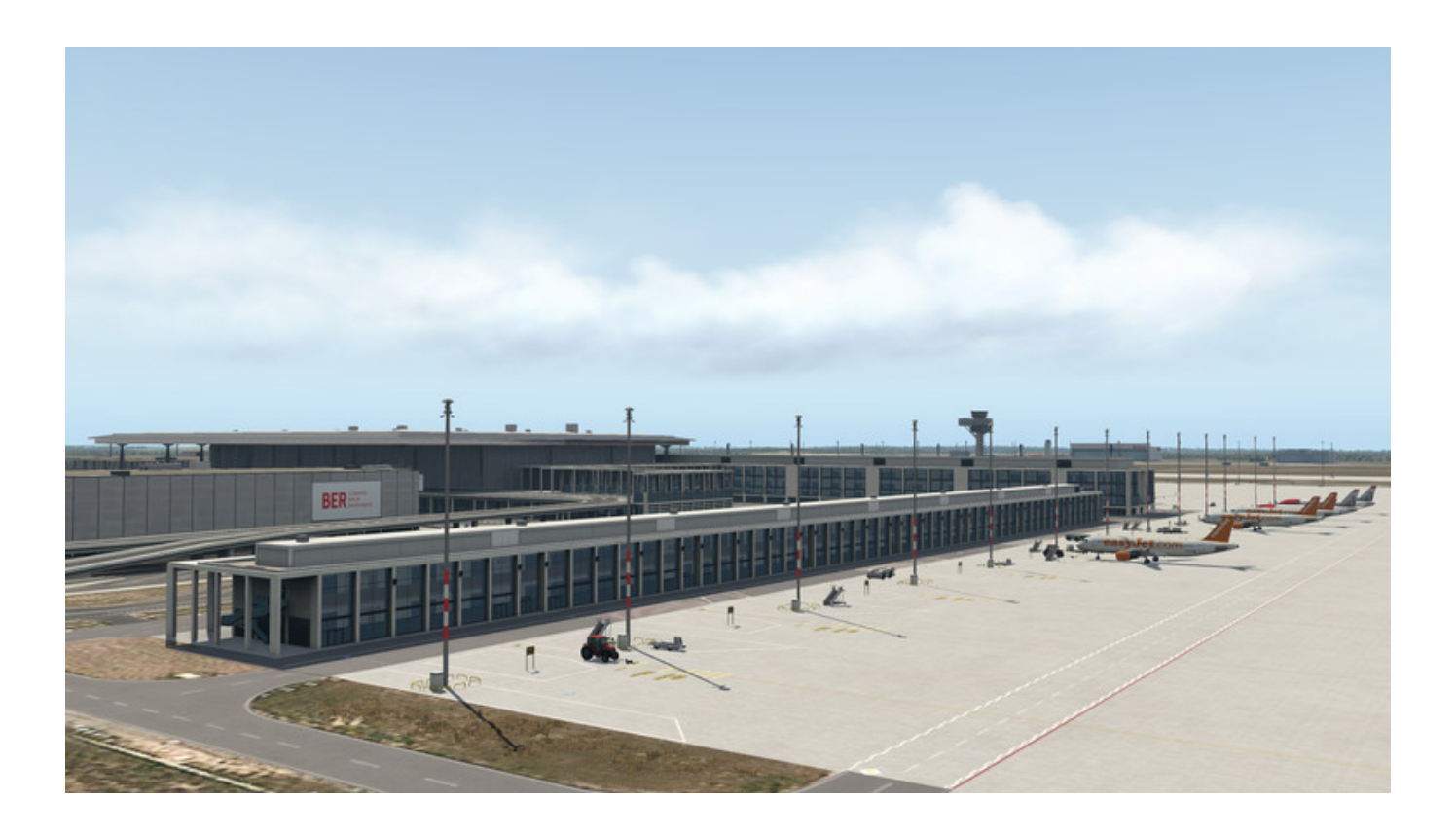
X-Plane 11 - Add-on: Aerosoft - Airport Berlin-Brandenburg Download Laptop

Download >>> <a href="http://bit.ly/2NKfFWm">http://bit.ly/2NKfFWm</a>